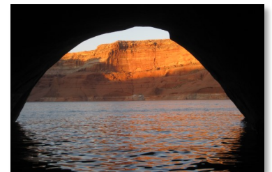
Missy's photo from Lake Powell.

I've vacationed in Central America, Mexico, many different islands, and most of the 50 states, but my favorite place is Lake Powell.