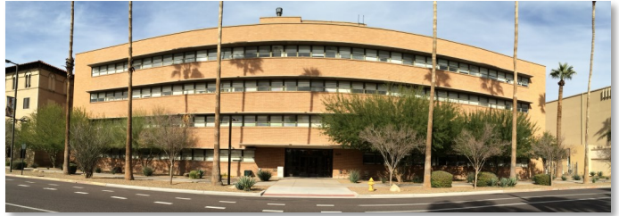
The AZ Dept. of Juvenile Corrections, located north of Wesley Bolin Memorial Park.

Some similarities between the Arizona Department of Juvenile Corrections and the Arizona Department of Corrections are the obvious correctional setting needs of the population with regard to commissary, health needs and clothing. Some contracts mirror ADOC’s with some minor differences due to the age of inmates/juveniles.