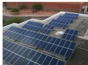
Solar Design and Construction Management