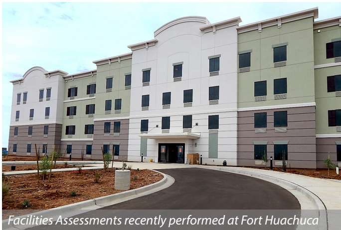
Facilities Assessments recently performed at Fort Huachuca

a. PROVIDE ANY ADDITIONAL INFORMATION YOU FEEL MAY BE NECESSARY TO DESCRIBE YOUR FIRMS QUALIFICATIONS. (ATTACH ADDITIONAL SHEETS AS NEEDED.)