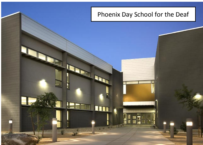
Phoenix Day School for the Deaf