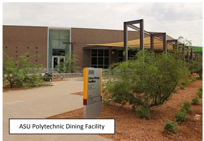
ASU Polytechnic Dining Facility