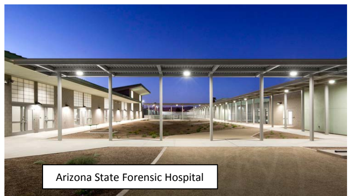
Arizona State Forensic Hospital