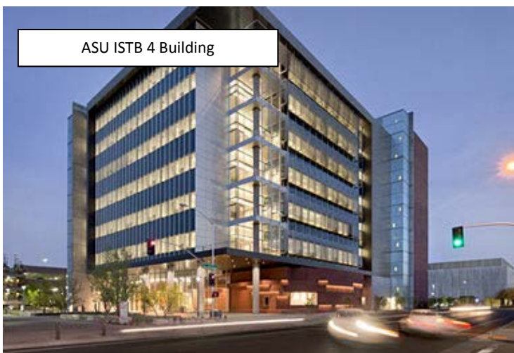
ASU ISTB 4 Building