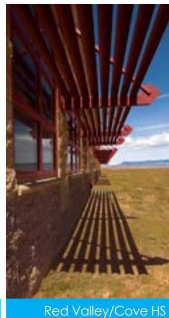
Red Valley/Cove HS

SPS+ Architects has served Arizona for over 50 years, working with Native American tribes for more than three decades.