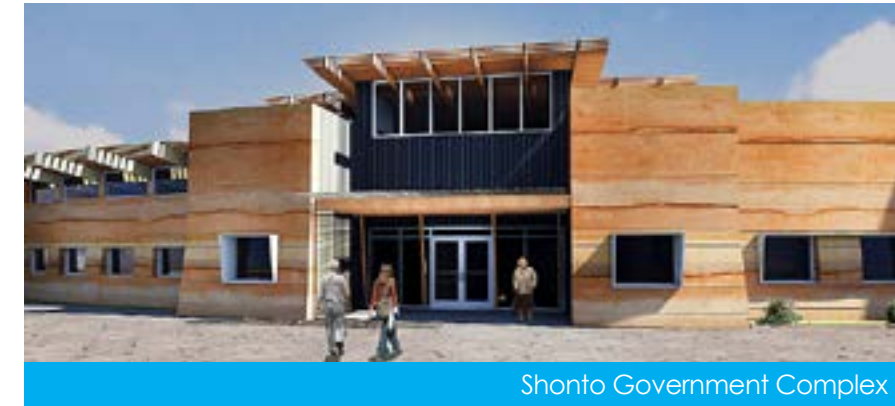
Shonto Government Complex

Our understanding of the needs of Native American communities runs deep, as evidenced by the over 30 projects we have completed in the last decade for the San Carlos Apache, White Mountain Apache, Navajo, Ak-Chin and Gila River Indian Communities.