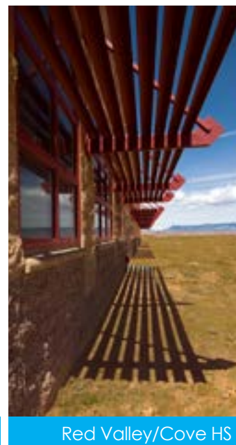
Red Valley/Cove HS

SPS+ Architects has served Arizona for over 50 years, working with Native American tribes for more than three decades.