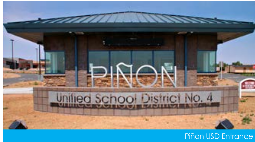
Piñon USD Entrance

Tuba City Vocational Building Tuba City, AZ (2007)