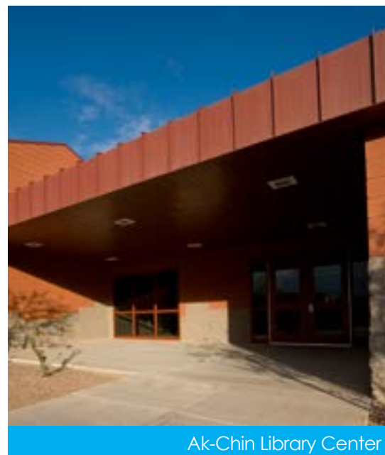
Ak-Chin Library Center