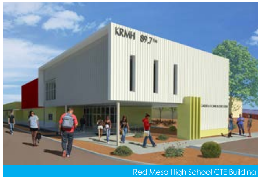
Red Mesa High School CTE Building