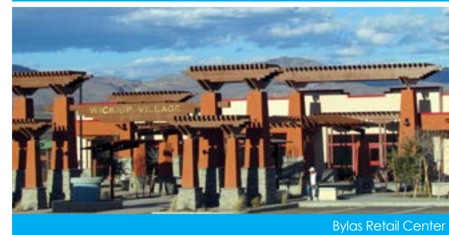
Bylas Retail Center