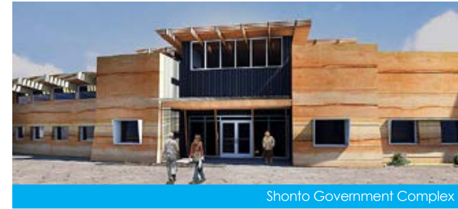
Shonto Government Complex

Our understanding of the needs of Native American communities runs deep, as evidenced by the over 30 projects we have completed in the last decade for the San Carlos Apache, White Mountain Apache, Navajo, Ak-Chin and Gila River Indian Communities.